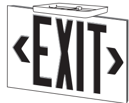
Ceiling Mount Option