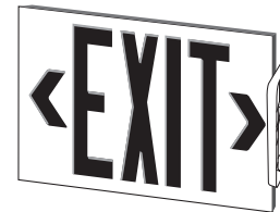
Flag Mount Option